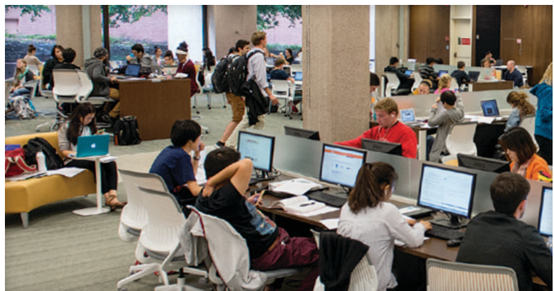
Above: renovated first floor, Bird Library. On the cover: column capital detail, Carnegie Library.

Total patrons served at Pages café: 203,368