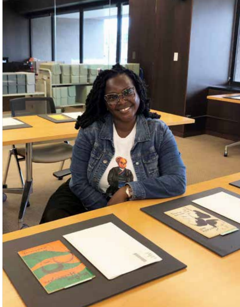
Special Collections Research Center curatorial assistant performing research