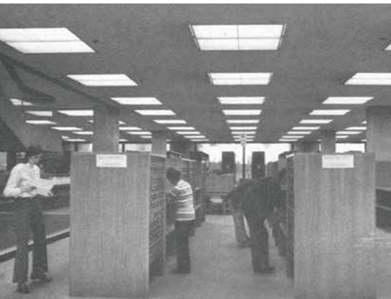
The Main Catalog, situated conveniently between the Circulation and Reference areas.