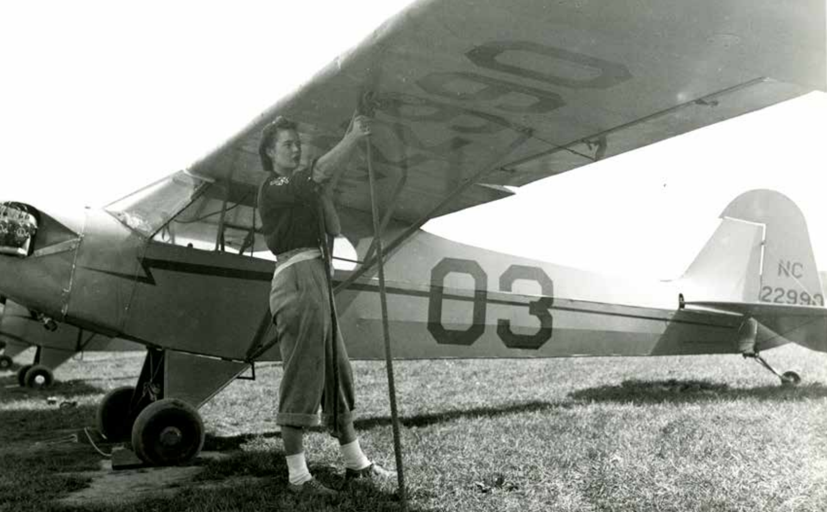
Circa 1940s