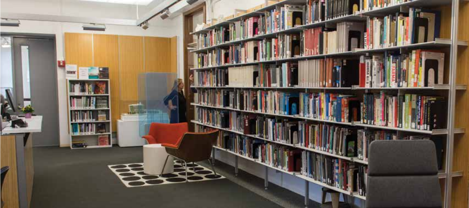
King + King Architecture Library in Slocum Hall