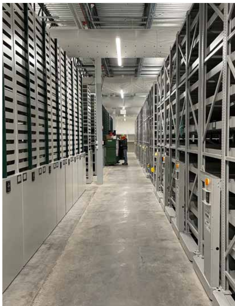
Syracuse University Libraries Storage Facility