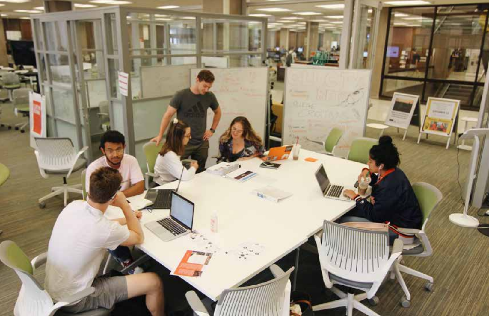
Student entrepreneurs working in the Blackstone LaunchPad