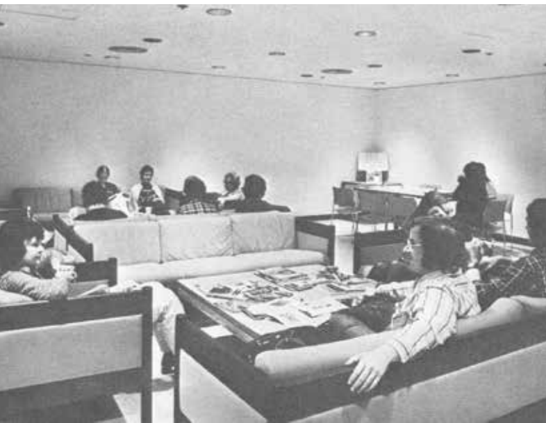
Librarians relax in the Staff Room.