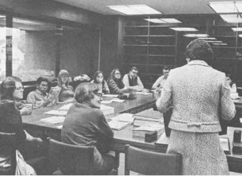
A Library Science class meets in the sixth floor Spector Room.