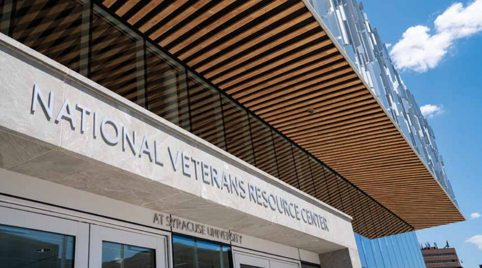
The National Veteran's Resource Center at Syracuse University