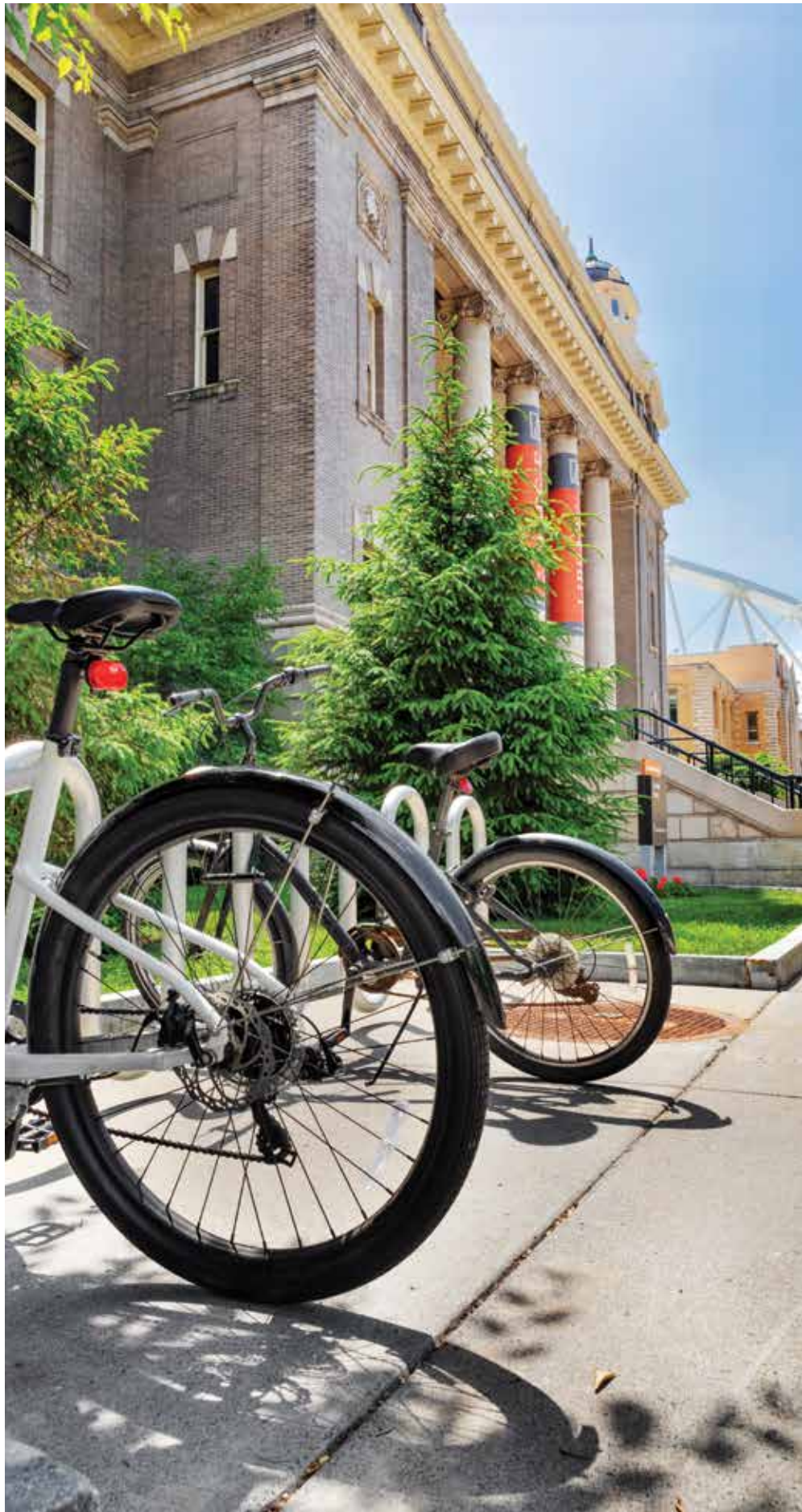
Bikes outside of Carnegie Library