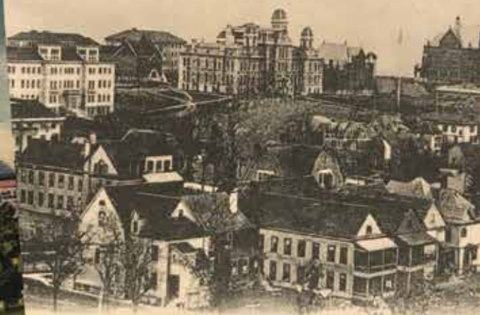
University Buildings, Syracuse, N. Y.