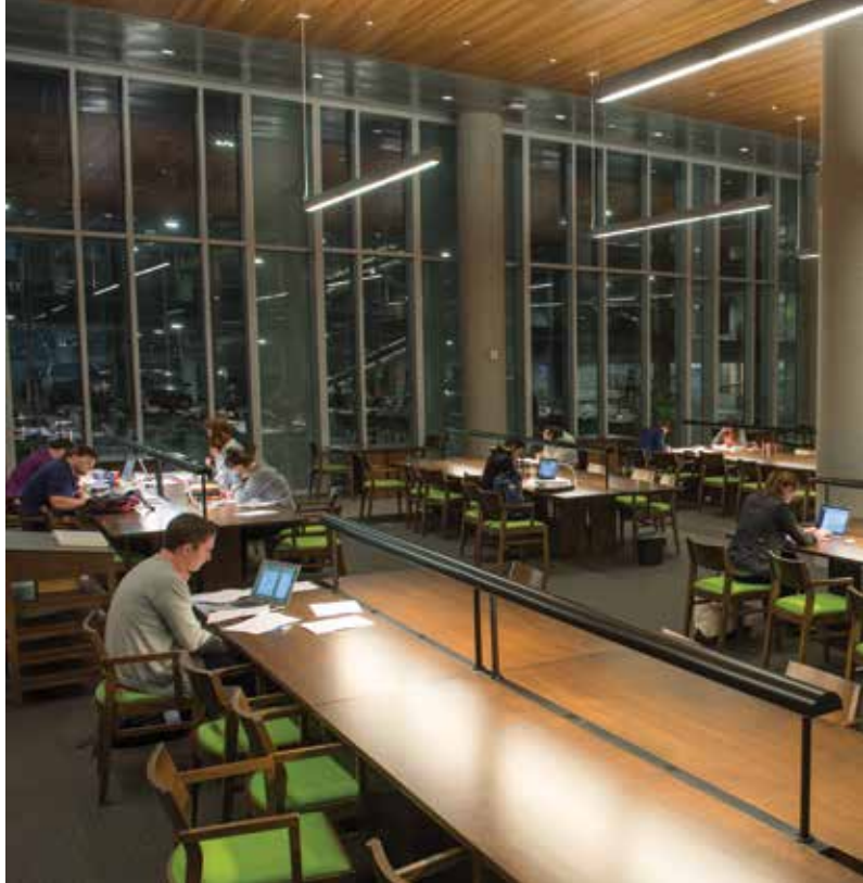
Law Library in Dineen Hall