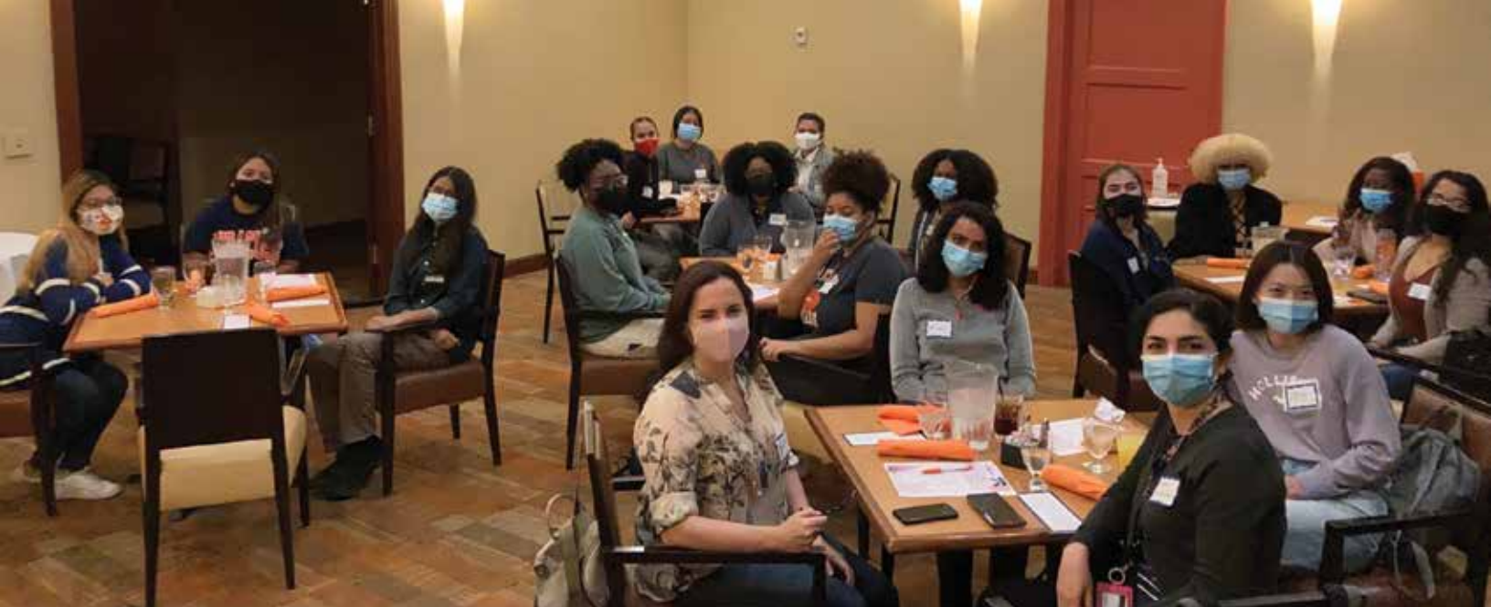
Women in Science and Engineering at Syracuse University