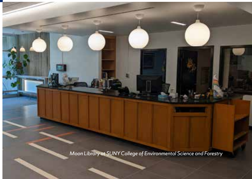
Moon Library at SUNY College of Environmental Science and Forestry

Just as SUNY College of Environmental Science and Forestry (ESF) students and faculty have access to Syracuse University Libraries’ resources, so too do SU students and faculty have access to ESF’s Moon Library. The reciprocal arrangement between the libraries means that the Syracuse University community can utilize the collections, spaces and resources available at Moon Library, including chargers and noise-cancelling headphones, access to the wireless network and use of the SU meal plan at the Cafe @Moon.