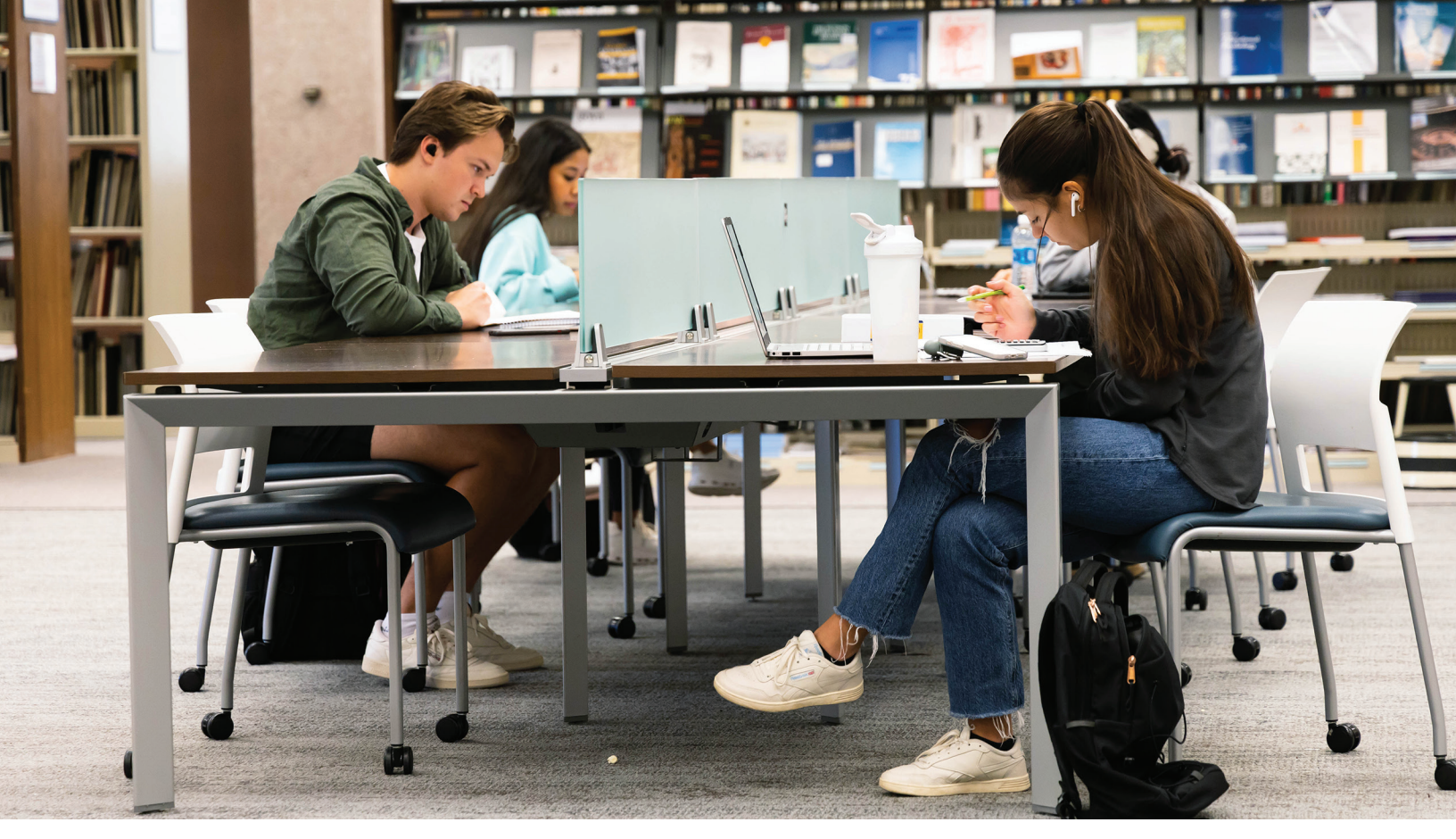
Students working on 2nd floor of Bird Library.