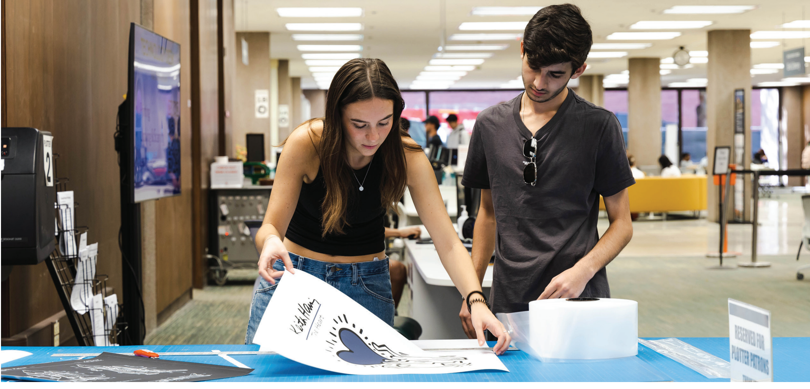
Students printing from plotter in Bird Library.