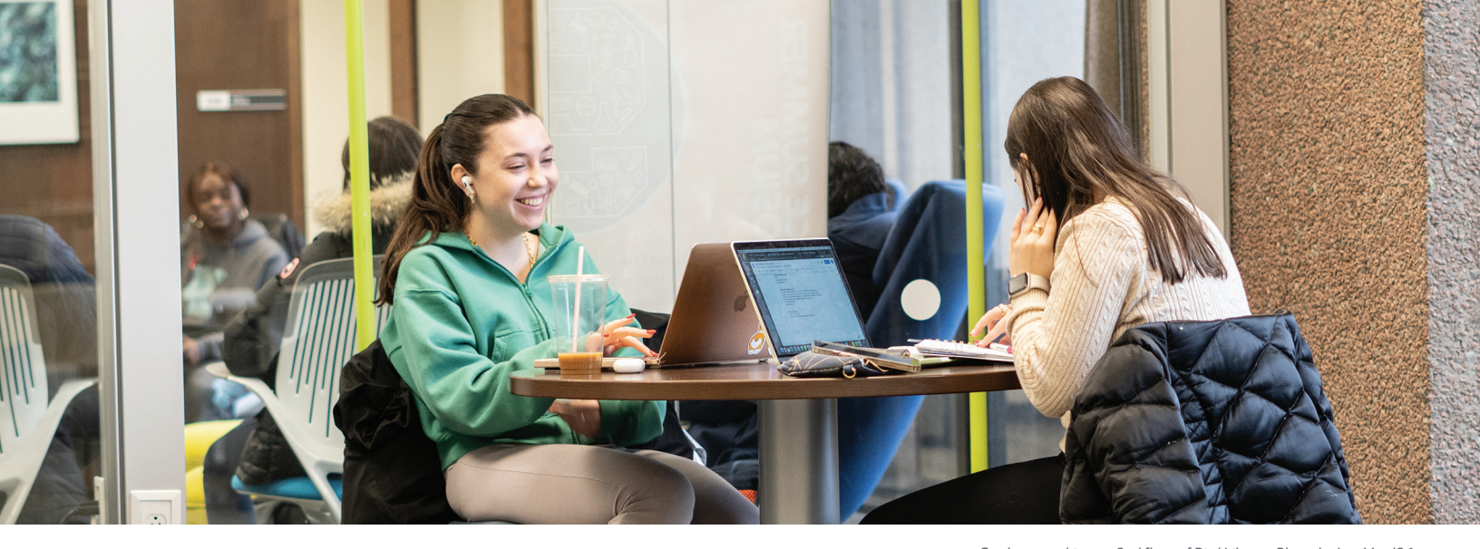
Students working on 2nd floor of Bird Library.